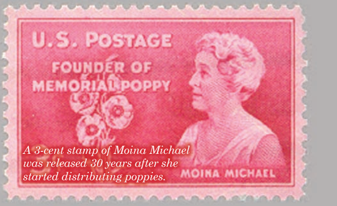
A 3-cent stamp of Moina Michael was released 30 years after she started distributing poppies.