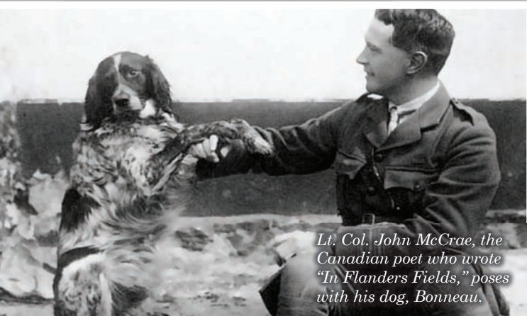
Lt. Col. John McCrae, the Canadian poet who wrote "In Flanders Fields," poses with his dog, Bonneau.